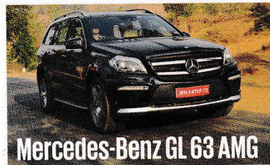
Mercedes-Benz GL 63 AMG