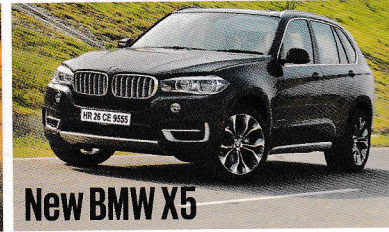
New BMW X5

PLUS » SsangYong's new mid-spec Rexton RX6 » Renault Koleos gets more power with auto