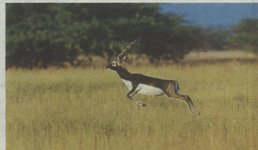
(Above) The blackbuck is one of India's most graceful and fastest creatures (seen at Velavadar National Park, near Bhavnagar);

India is really incredible and the challenge actually was what to include and leave out in the book. My book is about India's 100 Best Destinations, but you could easily do a book about 500 destinations. So, the challenge actually was in selecting the 100 best destinations.