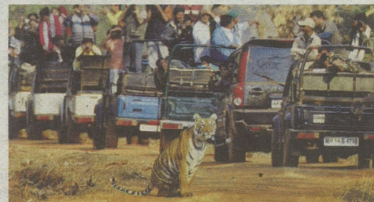
The tiger (at Tadoba Andhari Tiger Reserve) has quite an audience and seems to be enjoying all the attention